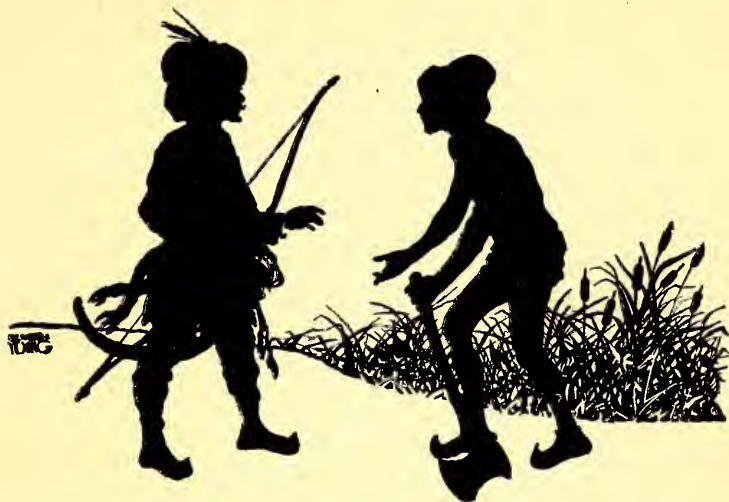
The water-sprite in the form of a woodman.

But the prince knew that it was a water-sprite and he said, "You have carried off my brothers!"