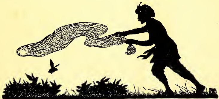
The fowler caught them all in his net.

So the quails quarreled, and while they were quarreling the fowler caught them all in his net. He took them to town and sold them for a good price.