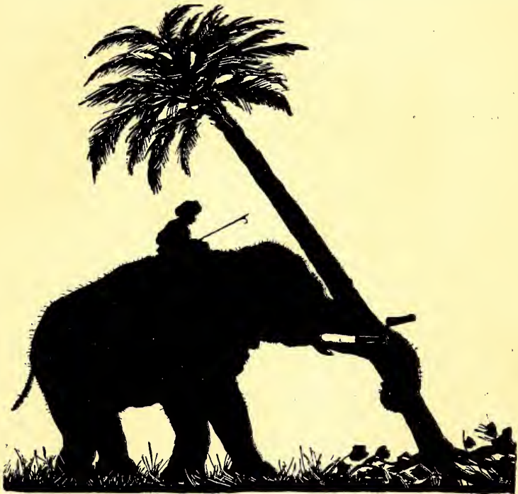
The Elephant used to pull up trees for the carpenters.

So the old Elephant told his son how the carpenters had taken good care of him when he was badly hurt and took him to them. The white Elephant did