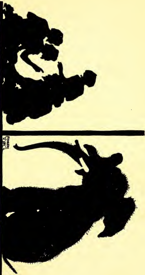
The talk of the robbers awoke Girly-face.