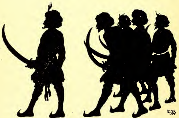
He himself with the head men stood on guard.

“Those fellows were not men, they were demons!” said the wise merchant. “They must have come out to make us throw away the water. Then when we were faint and weak they might have put an end to us. Go on at once and don’t throw away a single half-pint of water.”