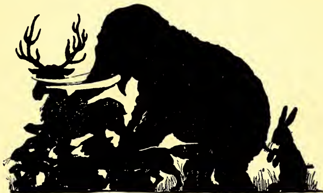
Saw the animals running.

They passed a Deer, calling out to him that the earth was all breaking up. The Deer then ran with them.