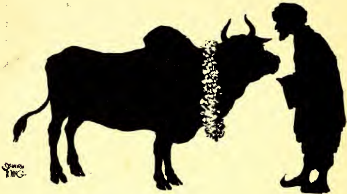
A garland of flowers about his neck.

are! You fine, fine creature!" And he patted his neck and stroked his sides.