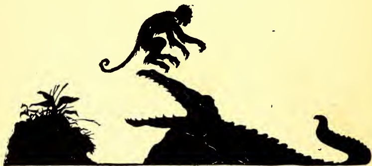
The Monkey jumped.

“You have caught me in a trap this time,” said the Monkey. “There is no other way for me to go home. Open your mouth wide so I can jump right into it.”