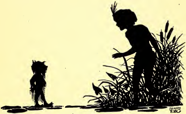
The Sun Prince went into the pond.

right answer to one question. Those who give the right answer will not be in your power. The question is, 'What are the Good Fairies like?'"