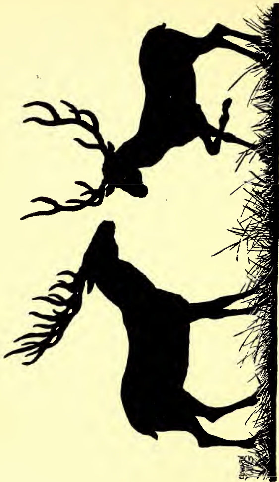
The King of the Banyan Deer sent for the King of the Monkey Deer.