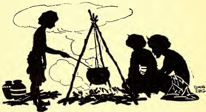
They built fires and cooked the rice.

cooked the rice. Then they spread a great awning over all the carts and the oxen, and the men lay down under it to rest until sunset.