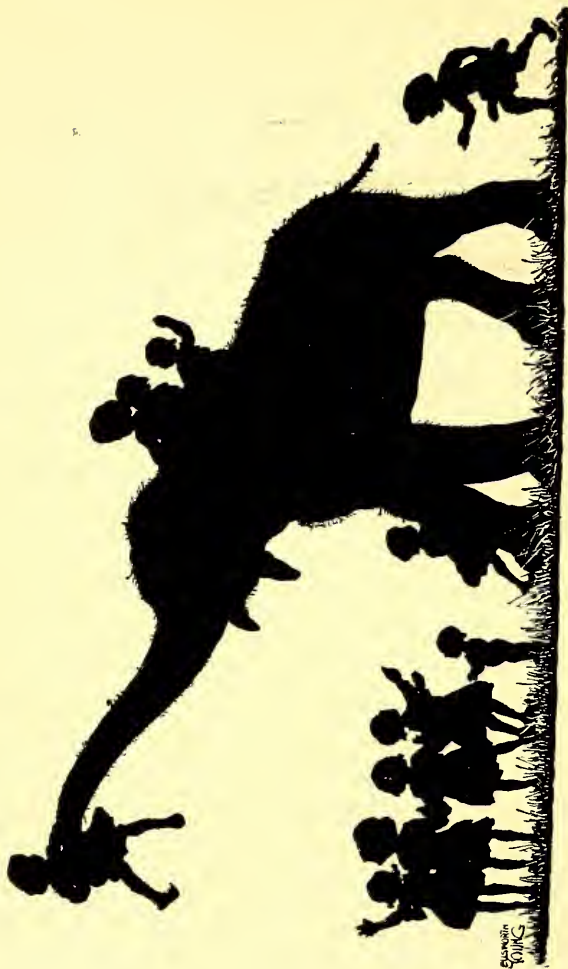
Blackie swung them high in the air.